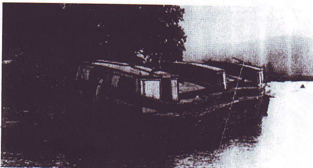
Typical C&O Canal boat